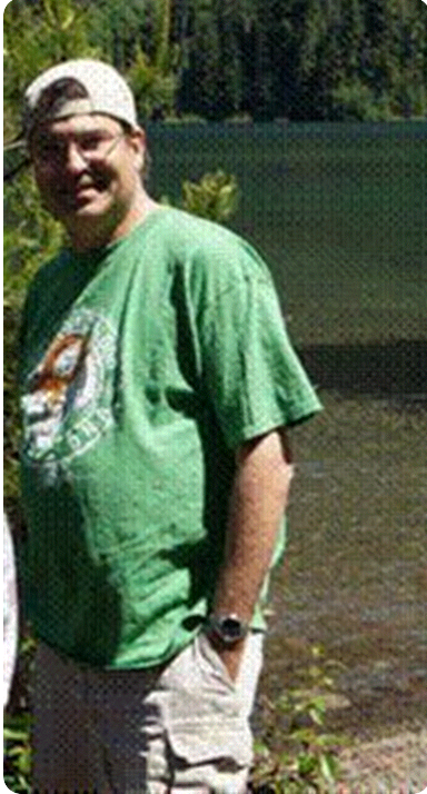
Camping with his Kids made him happy